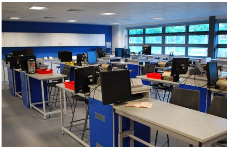
Above: Internal view of a Physics Laboratory.