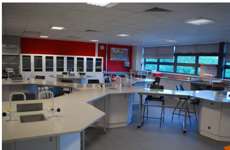
Below: Internal view of a Chemistry Laboratory.

For further information please contact the Science department on 01905 362600 ext 659